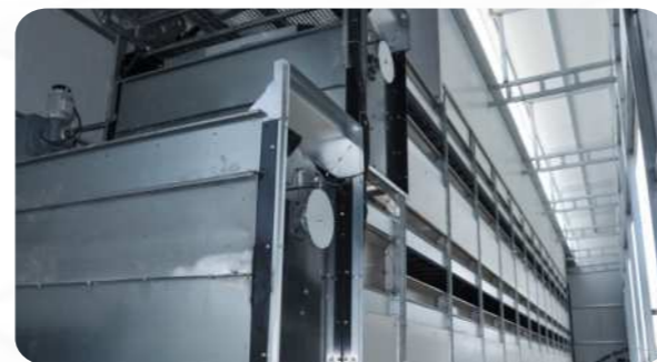
Capacity: 80,000 Birds Length of Block: 30M