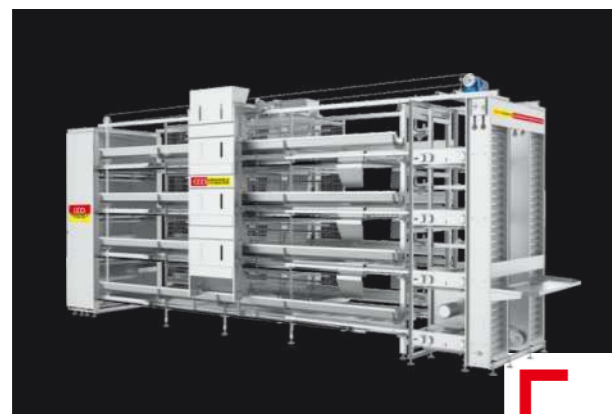
Intelligent Layer Cage System (4/5 tiers)

Great market prospects and profitability of dried manure