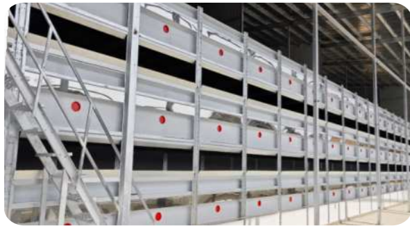
Capacity: 1,800,000 Birds, 10 Blocks Length of Single Block: 25M