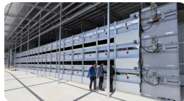
Capacity: 420,000 Birds Length of Block: 50M