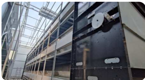
Capacity: 950,000 Birds, 2 Blocks Length of Single Block: 42M