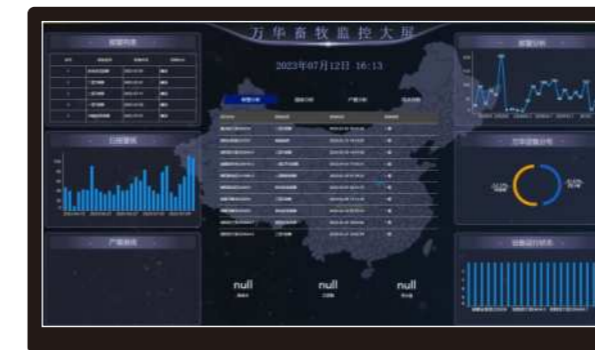
Intelligent Manure Drying Platform