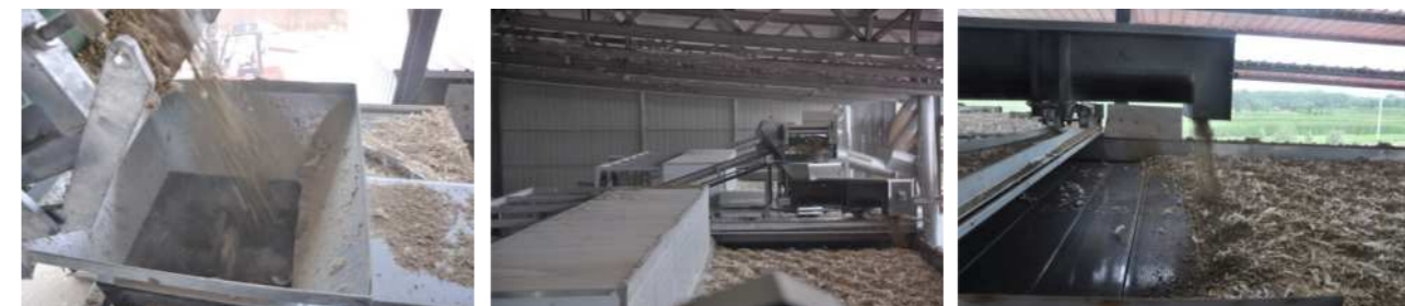
DISTRIBUTION DEVICE: Even distribution of manure on the drying plate leads to uniform and efficient drying