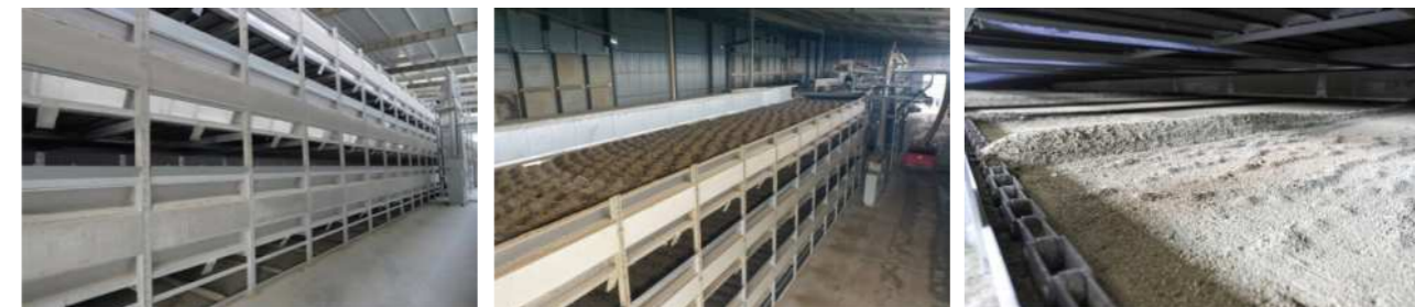
AIR-DRYING: Intelligent and efficient air-drying in tiers