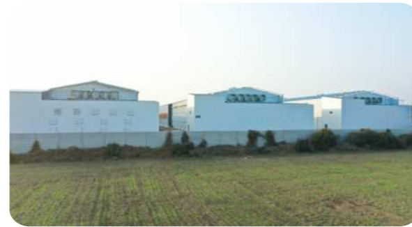
Capacity: 330,000 Birds, 3 Blocks Length of Single Block: 25M