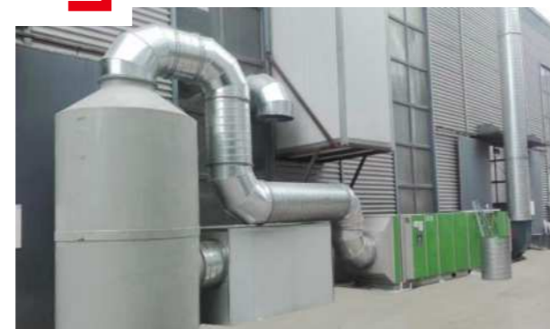
Waste Purification System