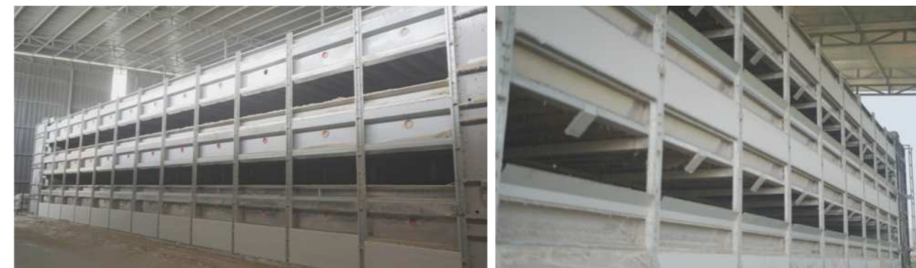
FRONT AND TAIL END: Customized height and length according to the farming capacity

Front End Process, Tail End Process, Distribution Device, Manure Drying Plate