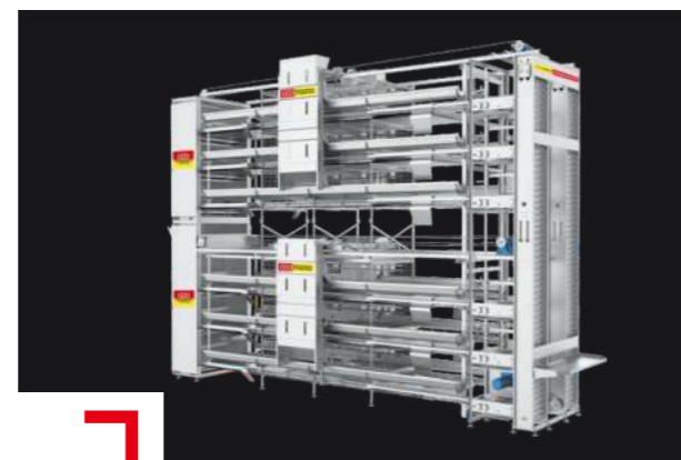
Super-High Constant Temperature Layer Cage System (6/8/9/10/12 tiers)