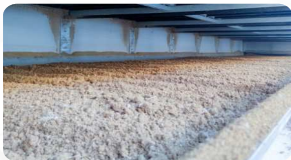
Capacity: 100,000 Birds Length of Block: 35M