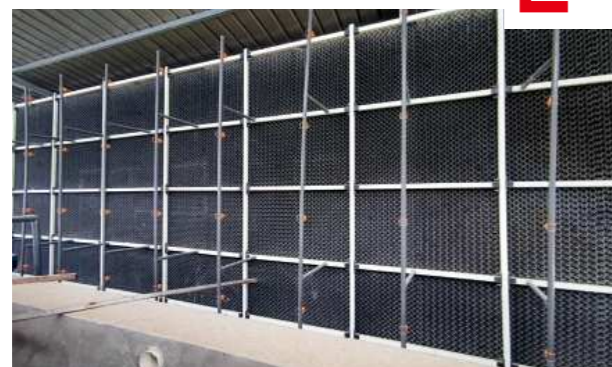
Feather Collection Equipment